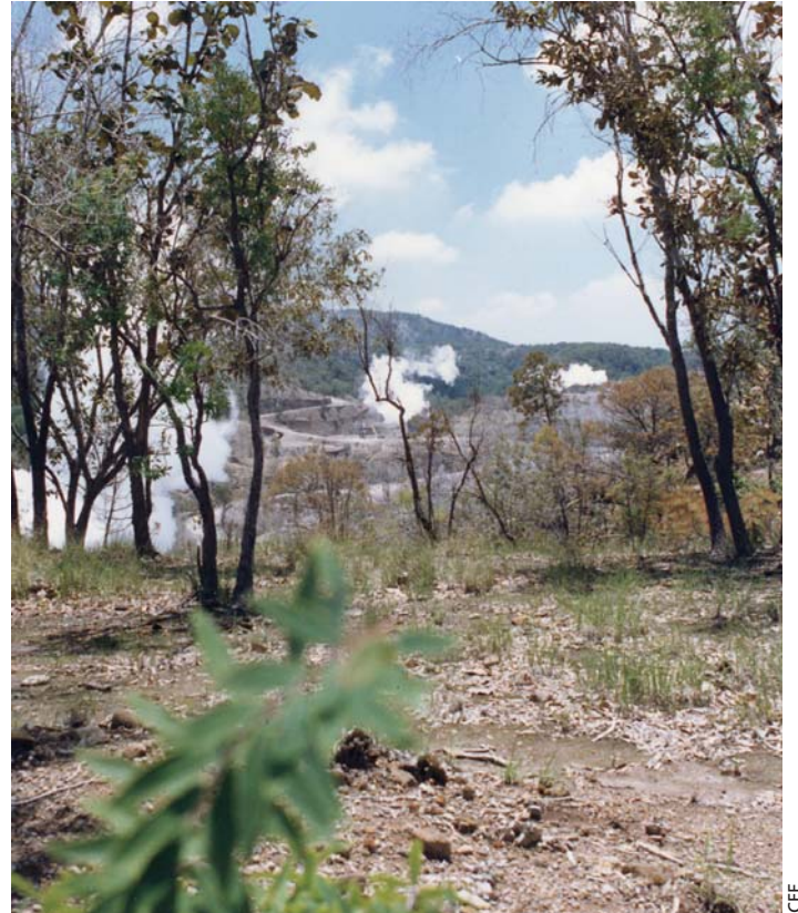
La Primavera Geothermal Field.

Thirty years ago, Mexico started the long journey of developing its geothermal resources to produce electricity. Today it ranks third in the world for geothermal power production, behind only the United States and the Philippines. Certainly, many achievements have been gained, but more must be secured. The journey is far from finished! ■