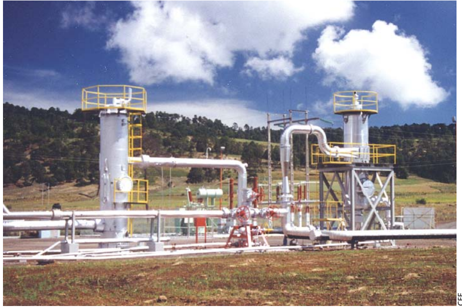
Los Humeros Geothermal Field.

The heat source for Los Humeros is the magma chamber that created the caldera. Some studies indicate that the chamber ap-