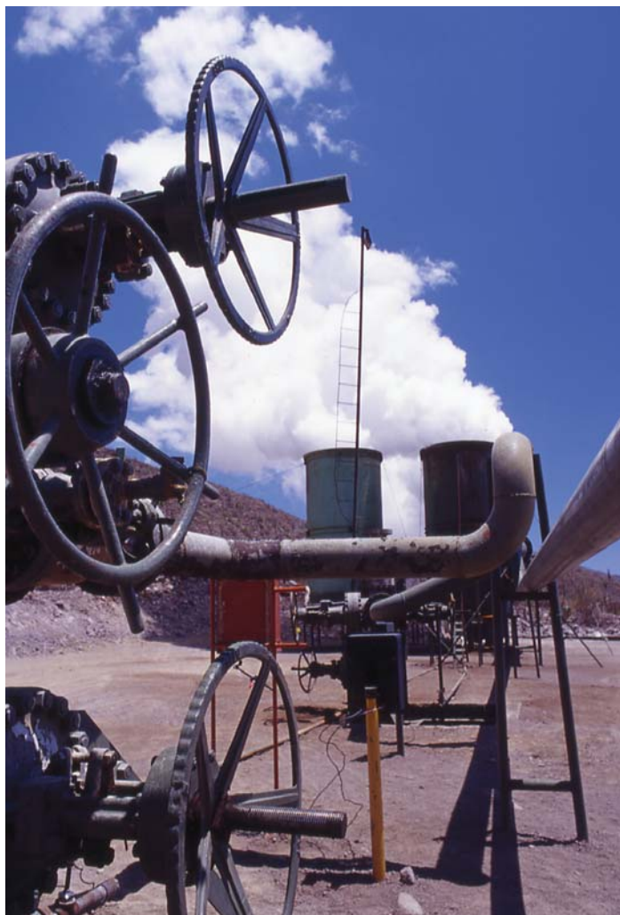
Las Tres Vírgenes Geothermal Field.

CFE has also carried out exploration studies and drilled exploration wells in other geothermal zones in Mexico, including: Aocolulco, La Soledad, the San Pedro Dome, San Antonio El Bravo,