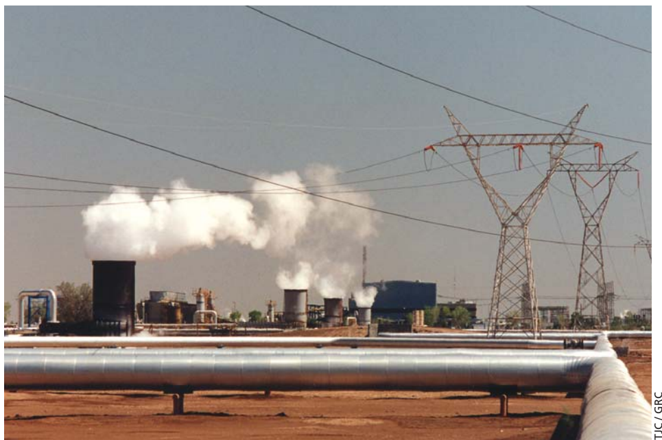
Cerro Prieto Geothermal Field.

The Los Azufres heat source appears to be related to the San Andrés volcano, located at the southern end of the reservoir. The field’s geothermal fluids are contained