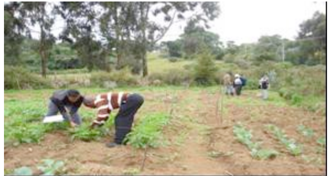
Plate 5. MAL, KenGen and farmers in one of the trial plots for the research.

The research was dubbed “Joint Research on Impacts of Geothermal Operations to Agricultural Activities and Live-stock Production in Eburru Area”. The research set up and activities were agreed upon by KenGen and MAL. KenGen agreed to fund the research while Ministry of Agriculture and Livestock (MAL) was to provide the technical expertise. The community was involved throughout the research to ensure results were socially accepted. Upon adoption of the proposal, the research commenced with a baseline study which was carried out in 2013 to collect information on soil baseline data (fertility test), socio-economic profile of the affected farmers, type of crops commonly grown in the area and production trends. The study was carried out through administration of questionnaires to some sampled farmers carrying out farming close to the wellhead and also analysis of the soil for both macro and micronutrients. Later on in 2013, KenGen and MAL launched the research. A team of environmental and liaison experts from KenGen participated in the research. The research was designed to involve affected farmers from planning, planting, and monitoring and data collection. Research activities being undertaken by MAL, KenGen officers and community members as KenGen organized is shown in plate 5.