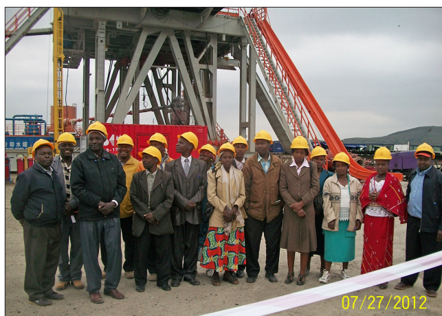
Plate 3. Stakeholders from Eburru during the visit to Olkaria drilling sites.

Prior to commissioning of the wellhead generator, KenGen had established a stakeholder committee that was comprised of the local administration (the area Chief and assistant chief), elected chairpersons and representatives from the five villages located within Eburru location. The committee was a forum through which community concerns were presented to KenGen for discussion and mutual agreement. KenGen appointed a liaison officer to be the contact person between the committee and the company. After the first incident, KenGen invited the committee to Olkaria Geothermal Field (where the company operates another