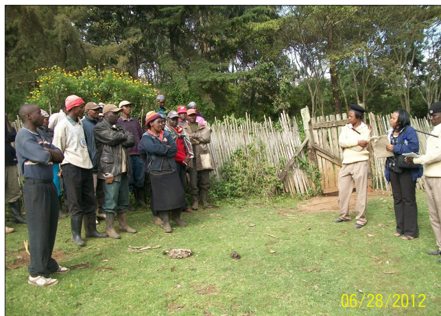
Plate 2. Some affected farmers, KenGen staff and local administration leaders at Eburru.

The preliminary investigation of the incident by KenGen indicated that some crops might have been affected by silica deposition, which clogged their stomatas. Following stakeholder consultative meetings, it was agreed that there was need to form a multi-disciplinary team consisting of KenGen, MAL Officers and Community representatives to undertake a crop damage assessment of the affected crops for purposes of ascertaining the allegations, which was to guide the decision making process. Subsequently, the multidisciplinary team in the presence of aggrieved farmers undertook crop damage assessment for the affected farms between 18 th -22 nd December, 2012. The report with the findings was forwarded to KenGen and Gilgil sub county Assistant Commissioner and later disseminated to the farmers through a public meeting. The report concluded that the crop damage was as a result of mix of issues, mainly poor agronomic practices on the part of the farmers and geothermal emissions from the wellhead power plant on the part of KenGen particularly for the farms in the vicinity of production well EW-01. Hence the multidisciplinary team recommended KenGen to compensate the affected farmers and explore ways to undertake a participatory research on impacts of geothermal operations on agricultural activities in Eburru.