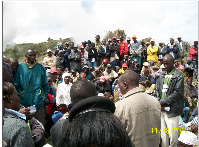
Plate 4. A public meeting organized by KenGen at Eburru.

The meeting was chaired by the Gilgil sub county assistant commissioner and was attended by KenGen’s environmental experts and the Geothermal Development Manager based at Olkaria. It was agreed that KenGen in collaboration with the affected farmers and the MAL were to launch a joint participatory research to ascertain the allegations of crop damage and determine the geographical extent of the impact. It was also agreed that KenGen was to compensate the farmers who were affected by the first incident as per the report prepared by MAL. KenGen fulfilled this agreement by compensating the affected farmers in 2014. The farmers also demanded that there was need for the existing stakeholders committee to be reconstituted and the Gilgil sub county commissioner gave them a go ahead to carry out elections and forward the names of the elected members to her office.