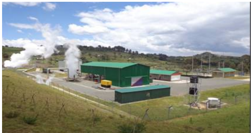
Plate 1. Photo of Eburru Geothermal Wellhead Power Plant.