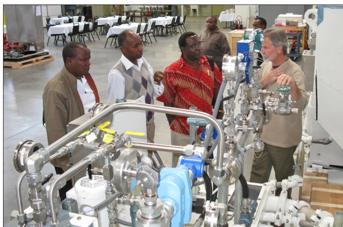
Figure 6. Training of KenGen Personnel at GDA's Reno Facility

GDA coordinated for training of KenGen engineers at OEM factories, including the turbine, condenser and LRVP, and the generator. During start-up and commissioning, GDA provided training of engineers, operators and maintenance personnel.