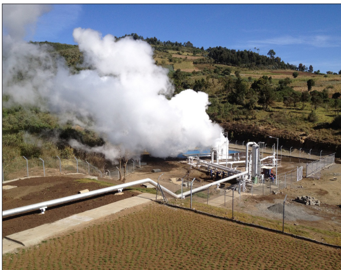
Figure 3. Production Well, Separator, and Rock Muffler.