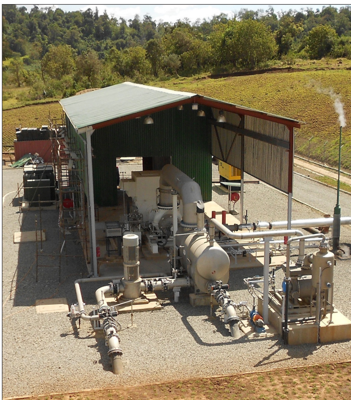
Figure 4. Power Shelter with T/G Set, Condenser, LRVP, and Main Cooling Water Pump.

the project. This included classroom presentations by a number of GDA's OEM suppliers. KenGen personnel were also able to observe testing of the equipment manufactured by GDA.