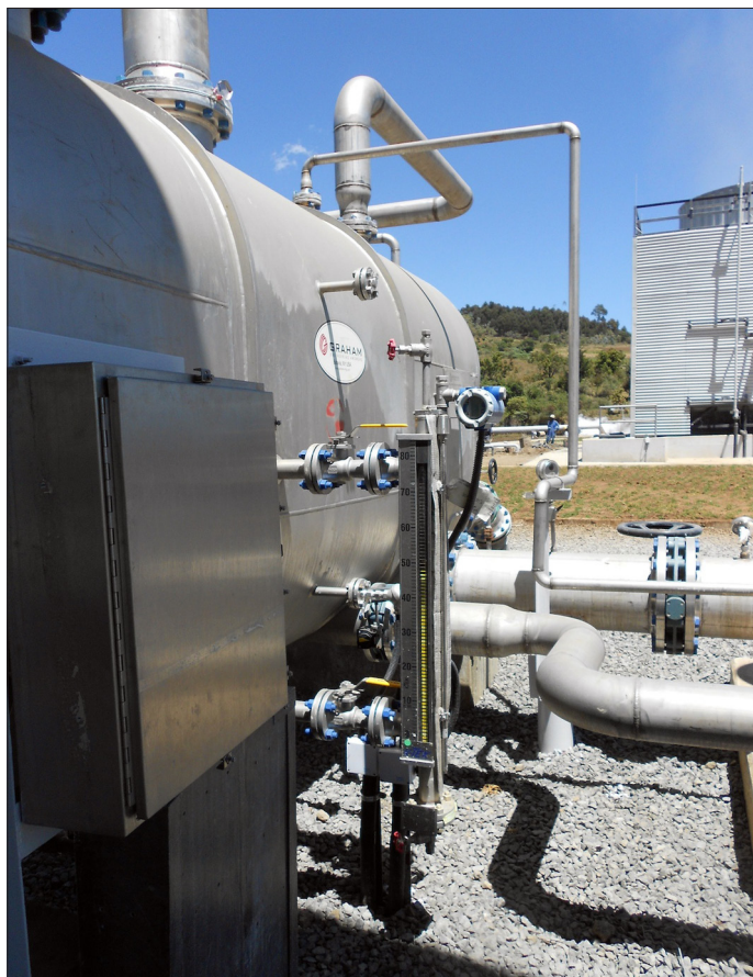
Figure 5. Condenser and Single-Cell Cooling Tower.