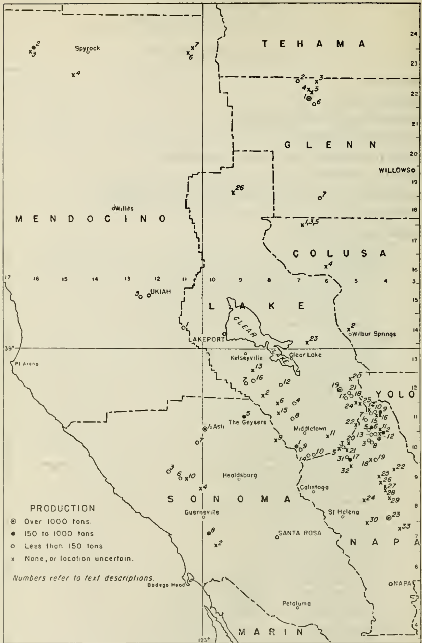
FIG. 1. Index map showing distribution of known chromite deposits in the northern Coast Ranges of California.