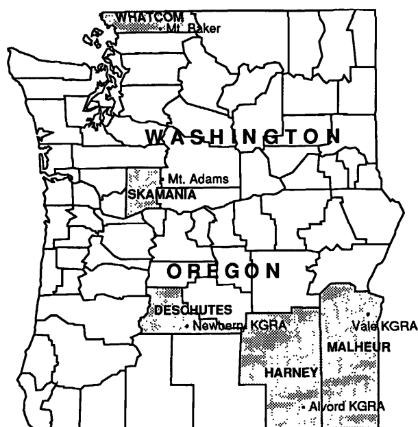
Figure 1. Locations of Economic Impact Studies

thermal impact studies by ODOE for Newberry Volcano, the Pueblo Valley (Alvord KGRA), and the Bend Highlands areas. ODOE also produced maps that facilitate analysis of these conflicts. Parameters analyzed include: